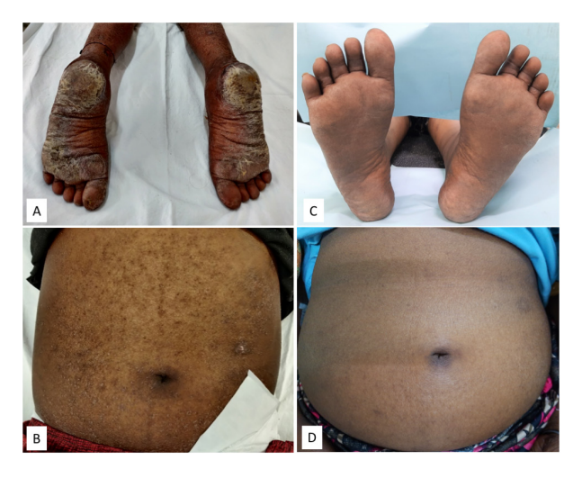
Figure 1. Cutaneous lesions at presentation (A and B) and at follow up after 3 months (C and D). A: Diffuse hyperkeratotic maculopapular lesions over soles; B: Multiple discrete hyperpigmented macules and papules in raindrop pattern and papulonodular lesions with atrophic center over the abdomen. C: Skin lesions over soles showing resolution at 3 months; D: Skin lesions over abdomen showing resolution at 3 months.