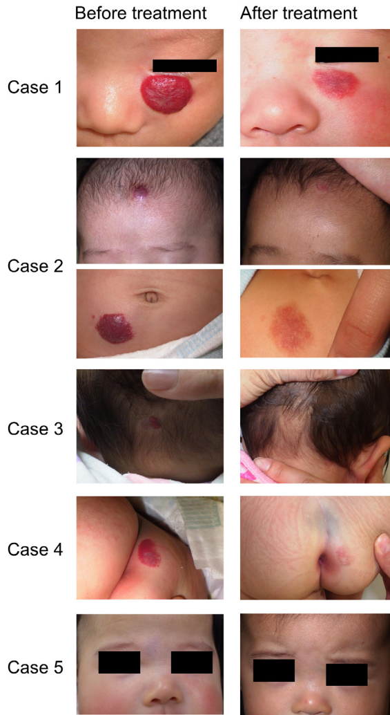
Figure 1. Clinical images of patient with infantile hemangioma included in this study. (left) Cases 1-5 before the treatment with propranolol, (right) Cases 1-5 during the propranolol treatment.

be increased during the treatment, albeit statistically insignificant. We found significant difference in the decrease of PDGF-BB levels during the treatment (Figure 3, p < 0.05 ).