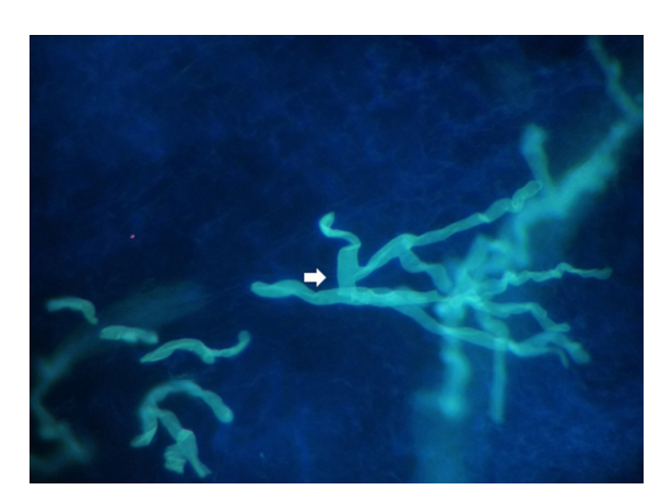
Figure 3. Microscopy findings. Broad aseptate hyphae are observed with right angle branching (arrow) and ribbon like folding under 40x in Calcofluor white-KOH mount indicating mucormycosis.

Hb: Hemoglobin, TLC: Total leukocyte count, Na: Sodium, K: Potassium, SGOT: Aspartate transaminase, SGPT: Alanine transaminase, ALP: Alkaline phosphatase, ESR: Erythrocyte sedimentation rate, CRP: C-reactive protein.