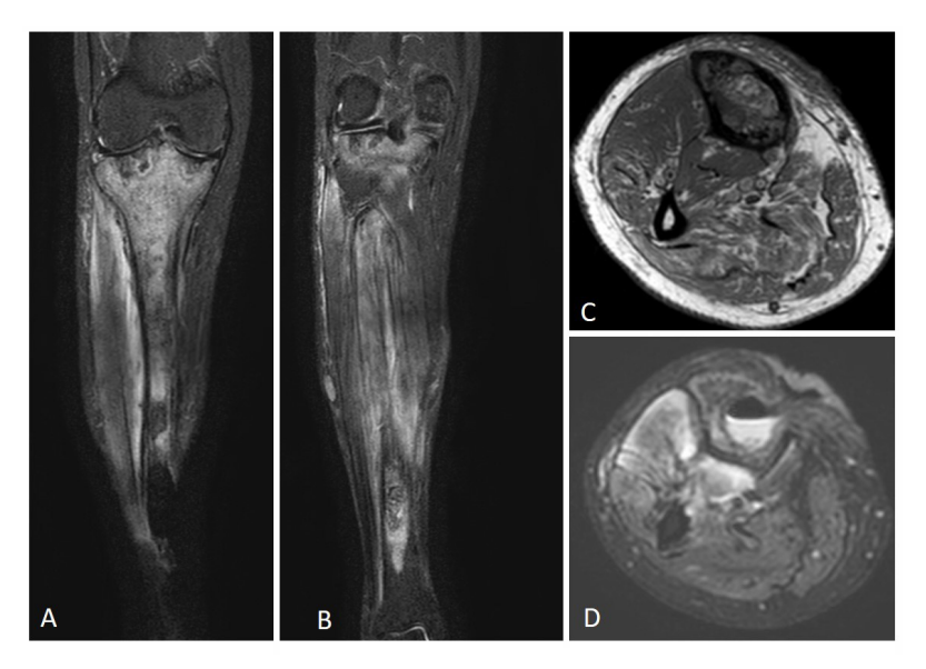
Figure 4. MRI images. (A and B) Fat suppressed T2 coronal images showing extensive marrow signal alteration involving the tibia. (C) Axial T1 weighted image showing cortical irregularity and erosions of the tibia. The fibula (*) shows normal marrow and cortical signal. (D) Axial fat suppressed T2 weighted image shows an air fluid level within the tibial marrow cavity with sinus tract extending to the skin surface (*). Note also the extensive edema involving the surrounding muscles (arrow).

extension following rhinosinusitis, which is a common site of presentation for mucormycosis. Both our patient had proven mucormycosis as aseptate hyphae was demonstrated in histopathology sections.